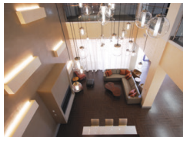
The Chancellor Hotel lobby.

The Chancellor Hotel at 70 North East Avenue is the host hotel for the 132<sup>nd</sup> APA Annual Convention in Fayetteville. Check-in is at 3:00 PM and check-out is 12:00 PM. For reservations, call 1-855-285-6162 . Room rate is $109.00 plus tax. Mention Arkansas Pharmacists Association Group for group rate. Cut-off date for rooms is May 18, 2014.