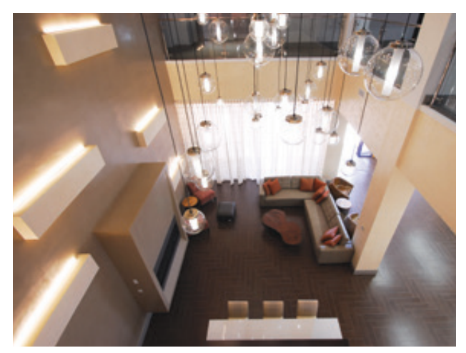
The Chancellor Hotel lobby.

The Chancellor Hotel at 70 North East Avenue is the host hotel for the 132<sup>nd</sup> APA Annual Convention in Fayetteville. Check-in is at 3:00 PM and check-out is 12:00 PM. For reservations, call 1-855-285-6162. Room rate is $109.00 plus tax. Mention Arkansas Pharmacists Association Group for group rate. Cut-off date for rooms is May 18, 2014.