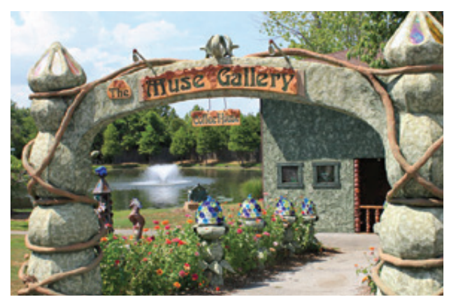
Terra Studio entrance.

The home of the Original Bluebird of Happiness® and the Pink Bird of Hope®, Terra Studios is a wonderland of art, a popular Northwest Arkansas tourist attraction and a family friendly destination. Watch as their collectible glass bluebirds are proudly made by skilled Arkansas crafts people. They showcase American arts and crafts, Ozark crafts, handmade collectibles and unique gifts created by local artists.