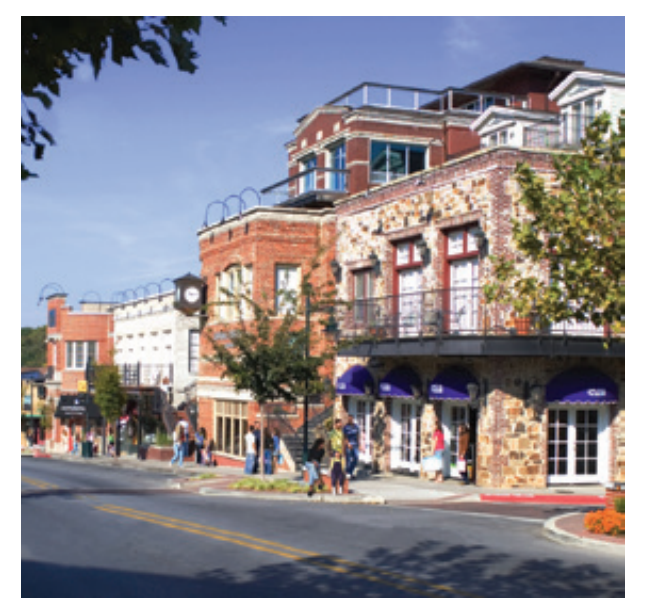
West Dickson Street in charming downtown Fayetteville.

This event is co-sponsored with the UAMS College of Pharmacy. For questions regarding CPE credit please contact the CPE Office at 501.686.5396.